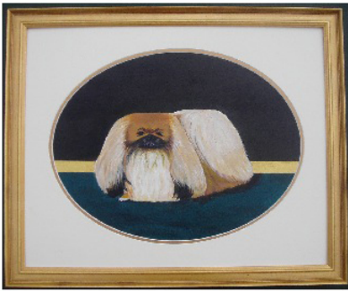
Size: 16" X 22"

If you wish more tickets or want to share this opportunity with your non PCA friends or local club members, feel free to print more copies.