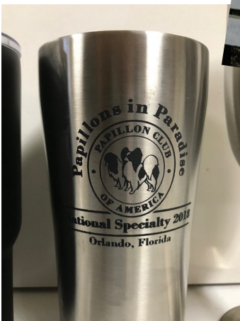
SEVERAL STYLES OF CUPS, MUGS, & WINE GLASSES