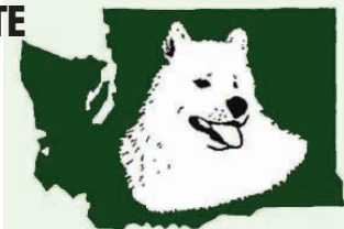
“Sams in Toyland”